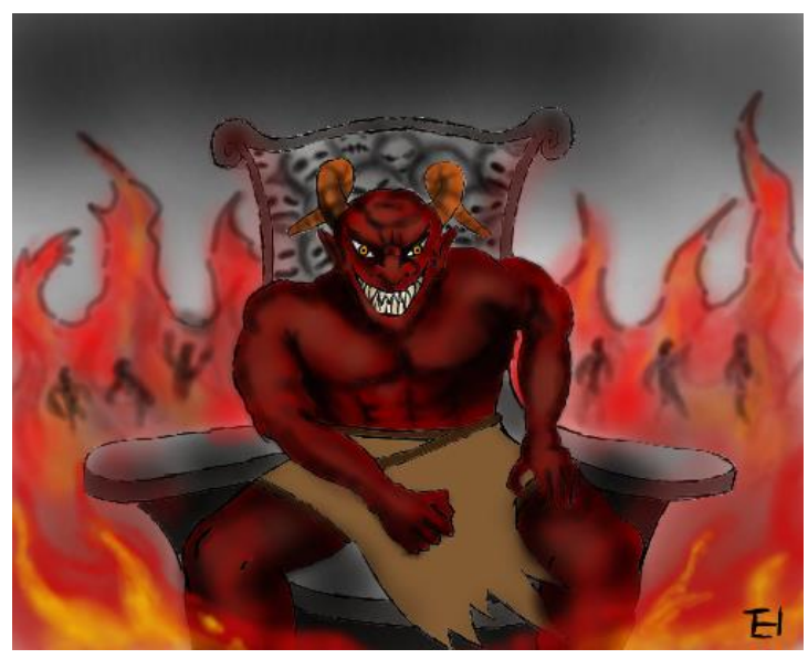
There is a cost for sin!

Juan 3:36 Mo sino nan mamati isnan Anakna, wad-ay ken siya nan fiyag ay maid pengpengna. Nay met achi nan mangad-i isnan Anakna, ad-i maitapi isnan fiyag ay maid pengpengna, mod-i ket sisyasisya nan songet Apo Dios ken siya.